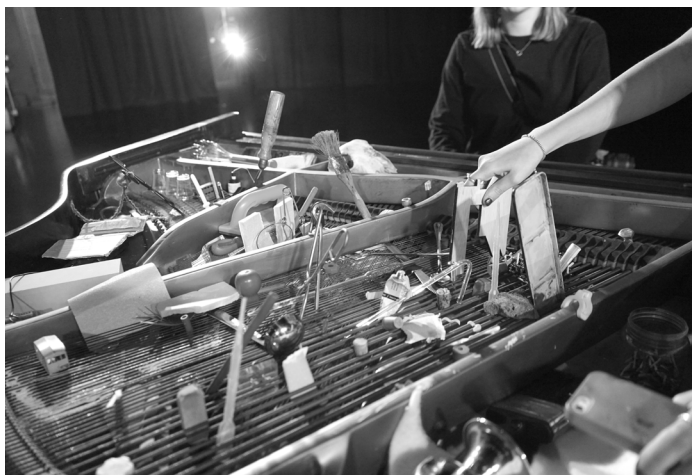
Johanna Billing, Each Moment Presents What Happens (2021), video, sound, 27 min./loop.

The film was commissioned by Bristol Grammar School to commemorate the opening of the 1532 Performing Arts Centre, and to create a bridge between the schools separate artistic departments, the new theatre and wider audiences. In the film, the new centre is seen in the context of the historic building facades, its grounds and great hall. Testing the differences between educational systems, as well as what qualifies as knowledge, the project creates a dialogue between the School, founded in 1532, now selective, independent and fee paying and the defunct Black Mountain College, founded in 1933 specialising in liberal arts education. The Untitled Event was originally held in the