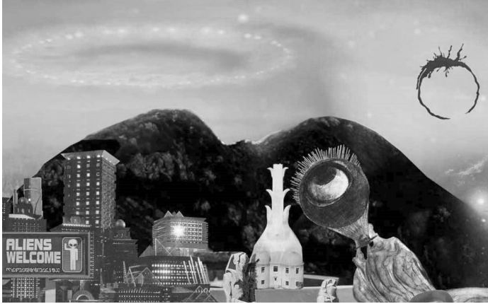
Dominique Gonzalez-Foerster, Metap panorama , 2022, detail.

LONDON, MAR. 16 – Alienarium 5 , an exhibition by Dominique Gonzalez-Foerster, will be presented at Serpentine, in London from 14 April until 4 September 2022. It is the artist’s first major institutional solo show in the UK since TH.2058 at the Tate Modern’s Turbine Hall in 2008. In Alienarium 5 , Gonzalez-Foerster imagines possible encounters with extra-terrestrials through speculative, performative and visual fiction. Conceived of specifically for Serpentine, the exhibition will feature almost entirely new work situated both inside and outside the gallery. Approaching from the park, visitors will first come across a statue in remembrance of the coming alien developed together with writer and philosopher Paul B. Preciado, as well as elements of a soundscape made with musician Perez, a long-time collaborator and co-conspirator for Exotourisme , a video and film installation developed for the Centre Pompidou in 2002 which later led to a collaborative musical project. Inside the gallery, Alienarium 5 will continue as a 360-degree panorama, an olfactive extra-terrestrial collaboration with Barnabé Fillion (Arpa Studios), an otherworldly holorama expanding the artist’s ongoing series of ‘apparitions’, and a new VR piece that, following on from her critically acclaimed Endodrome presented at the 2019 Venice Biennale, marks the artist’s second VR work produced by HTC Vive Arts. The exhibition will be accompanied by a publication.